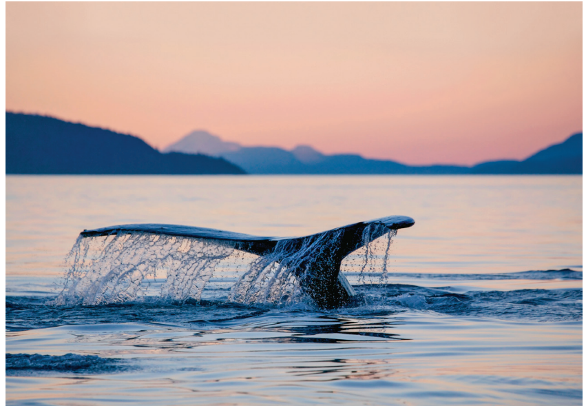
WHALE WATCHING, QUÉBEC

Unleash your inner explorer in the remote wilds of Eastern Canada. Discover this region's rich colonial past amid stunning natural settings. Admire the unparalleled beauty of the rugged coast of the Canadian Maritimes. Cruise along the wide expanse of the St. Lawrence River and marvel at the scenic Saguenay River Valley, with its dramatic cliffs and intriguing wildlife. Engaging shore excursions in each port allow you to better enjoy all that this region has to offer.